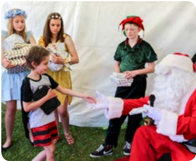
Santa and his helpers make sure every child received their gifts