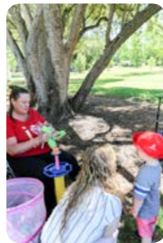
Above: Madhatterz Face Painting provided animal themed balloons