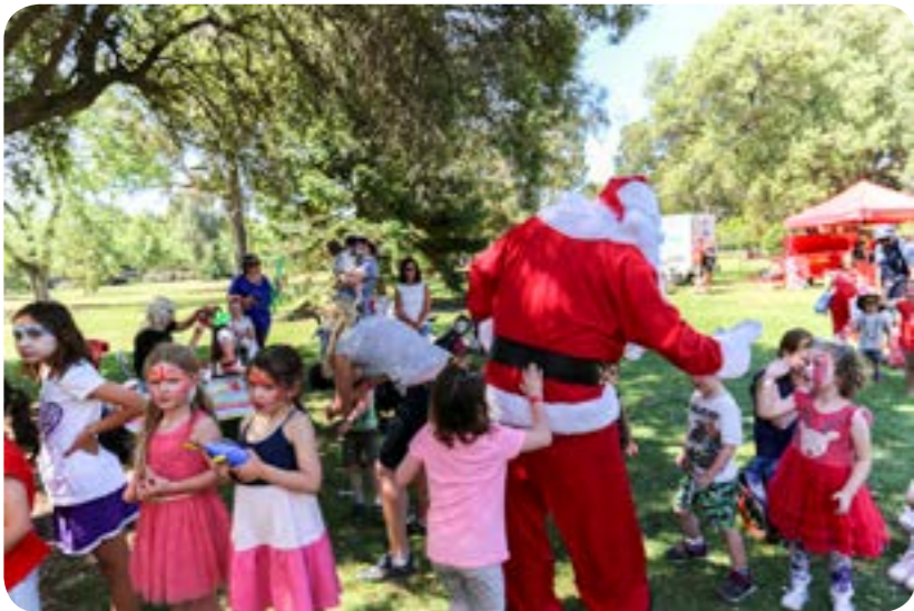
After being so patient, Santa finally arrives to the joy of every child