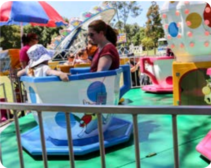
The Tea Cup ride was popular with children and parents