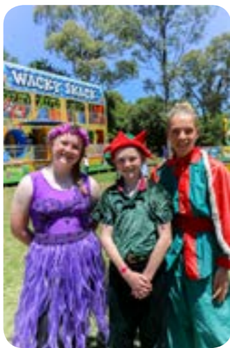
Above: Santa's helpers from Urrbrae Agricultural College