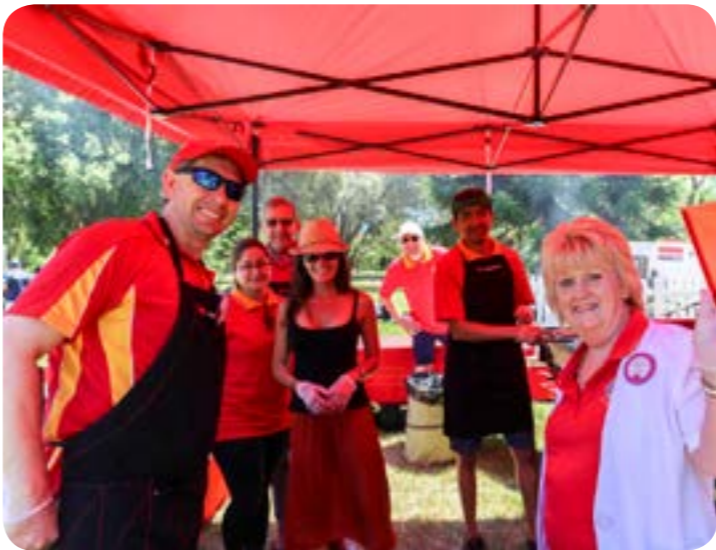
BBQ supplied by the Lions Club of Adelaide