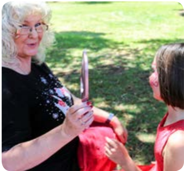
Facepainting was supplied by Madhatterz Parties