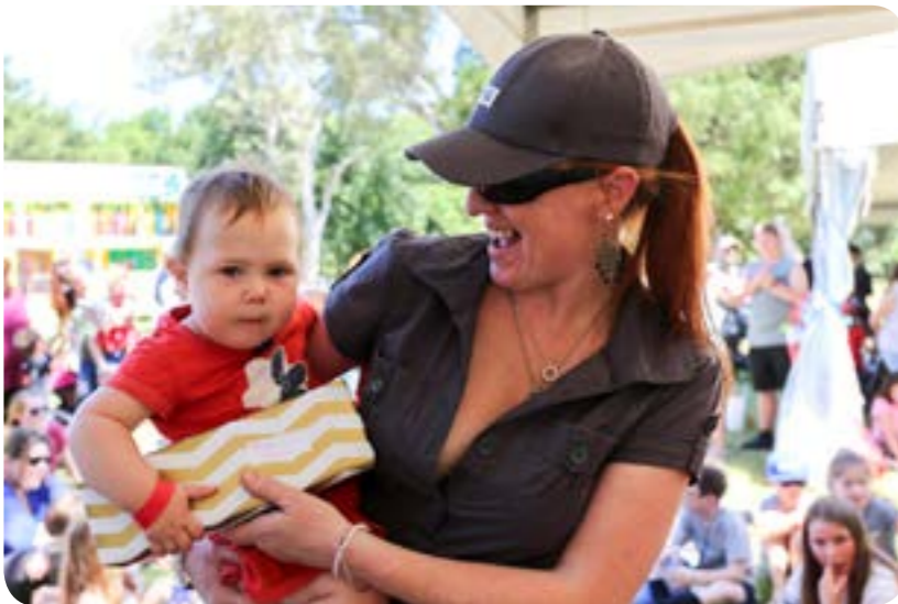
Age proved no barrier for those who wanted to try on Crimson Thunder's helmet or come up and see Santa to receive their gifts