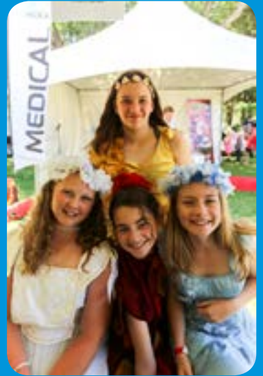
Santa's helpers at the annual Craniofacial Christmas Picnic