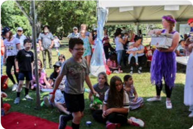
With over 250 people coming along to join in the festivities the Santa fairies had plenty to keep them busy